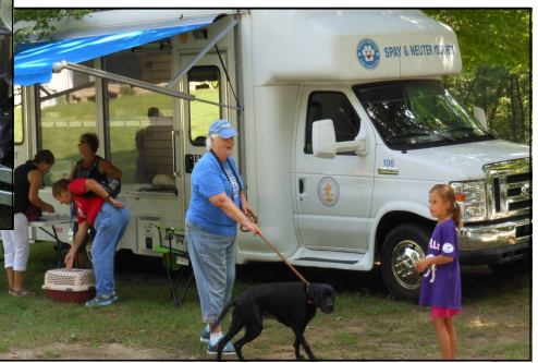
Local animal shelter found a home for a dog. A match made in heaven!!